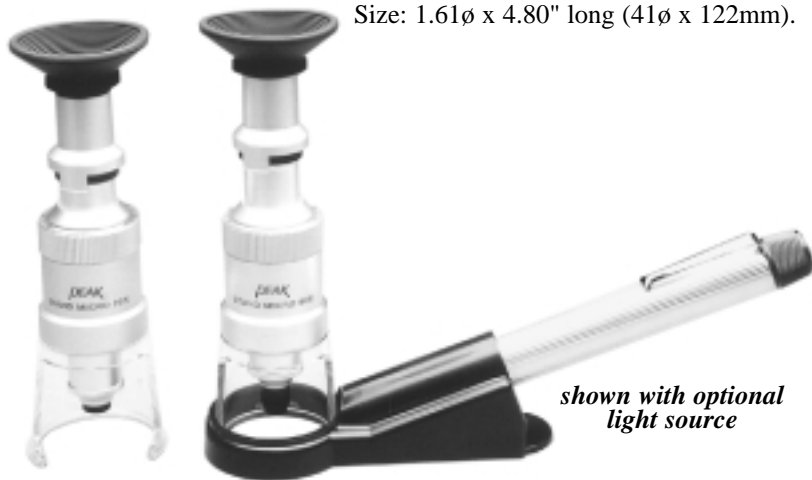
shown with optional light source

This economy stand microscope is small, portable and convenient to use. It measures the thickness, height or depth of objects. A scale is built into the chamber above the focusing ring. Size: 1.61ø x 4.80" long (41ø x 122mm).